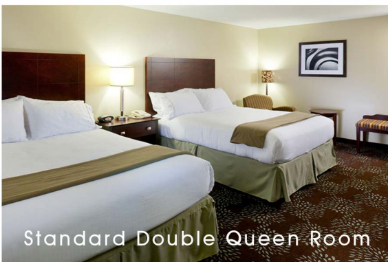
Standard Double Queen Room