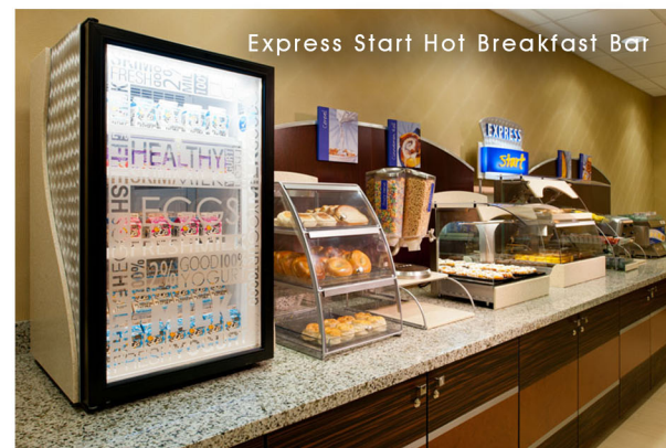
Express Start Hot Breakfast Bar