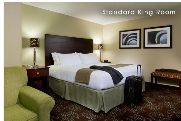
Standard King Room

Larger Guest Rooms than most hotels in the area All Guest Rooms Feature Microwaves and Mini-Refrigerators Free High Speed Internet Access including Free Wired Internet in All Guest Rooms Eight Guest Room Floors all Interior Corridors 32" Flat Panel HD TV's Over 50 channels HD, cable TV, and HBO KEURIG Coffee / Tea Maker In Room Iron & Ironing Board Hair Dryer Bath & Body Works™ Soaps, Shampoos, & Lotions Voice Mail System Free Local Calling Desk with Executive Chair ADA Accessible Rooms